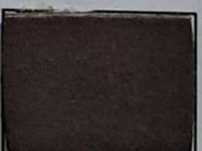
Dark Brown BL. Conc.