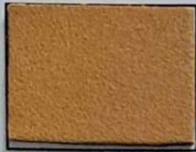
Beige Brown R