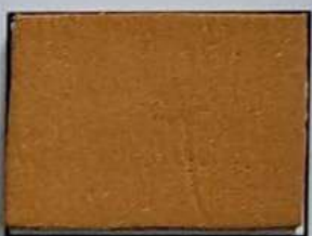
Yellow Brown 2RI