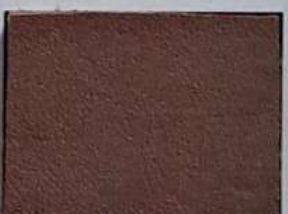
Dark Brown FBR