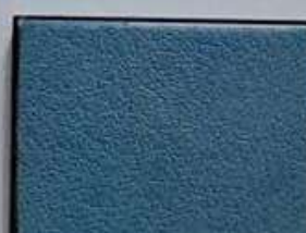
Blue 2 G