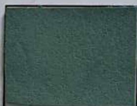
Dark Green B