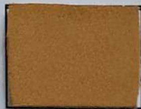
Brown 3 GN