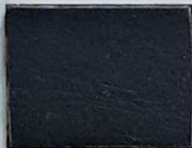
Black NT SPL