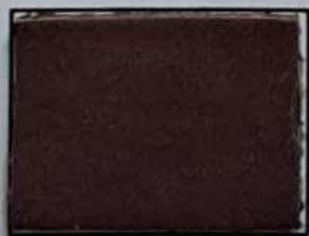
Dark Brown FBCN