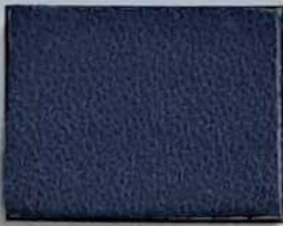
Dark Blue FBN