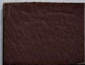
Dark Brown FBTI